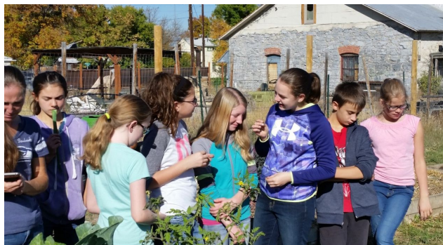
Seventh grade students from St. Andrew School tasting onions at the Helena Food Share Community Garden

Gardens are not only a good way to care for the earth and people in need, but they can also be patriotic. Victory Gardens were gardens that citizens of the United States used during World War II. At that time, the people not fighting in the war had gardens to feed themselves. Since the people not fighting fed themselves from their gardens, farmers could focus on feeding the soldiers. Today, people who have a garden often use it as a patriotic symbol with flowers of red, white, and blue to represent the end of wars and our gratitude for peace.